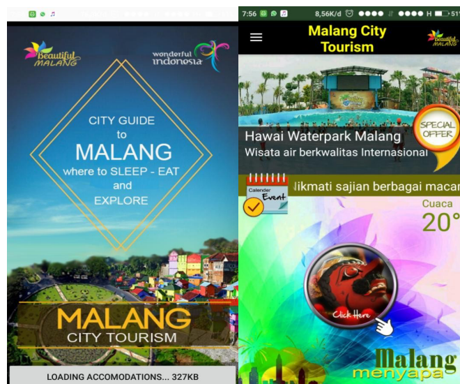
Figure 1 Home from Malang Menyapa

The Department of Culture and Tourism of Malang City is currently starting to develop a mobile application to help tourists visiting the City of Malang, that is "Malang Menyapa". This application was released on April 1, 2017. This android-based application can be downloaded from the Google Playstore, but this application is not yet available in the Apple Store. The Malang City Greetings application is managed by the Malang City Tourism Culture Office. In it there is a menu to search for lodging, hotels, home stays, and there is a tourism map of Malang City. In addition, there is also a map that will later be able to show the location of the inn or restaurant that tourists will go to by activating the GPS. Since the Malang City Cultural and Tourism Office cooperates with tourism business actors so that the content is done by tourism business actors themselves.