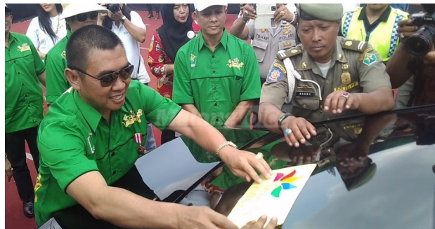
Figure 4 Beautiful Malang sticker stamping on The Service Car