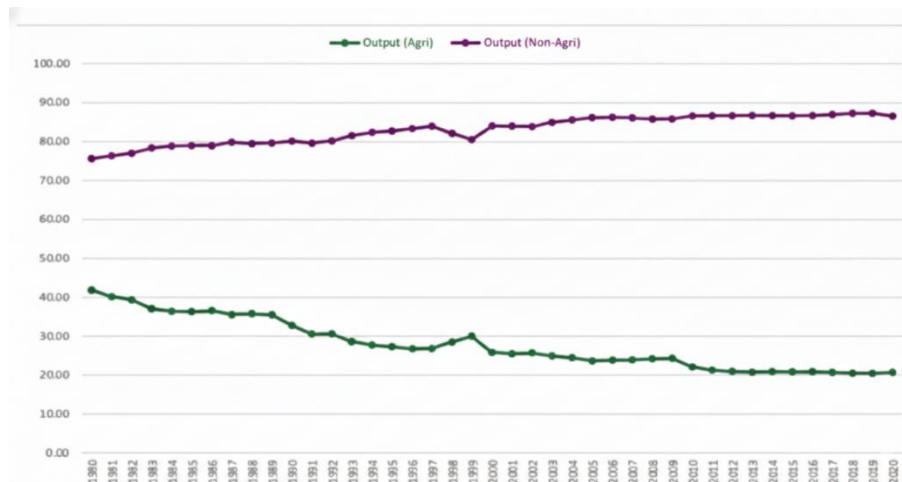
Figure 1. Comparison of the Contribution to Indonesia's GDP (%) from Agricultural and Non-Agricultural Sectors

shift from agriculture to industry in Indonesia reflects the rapid economic structural transformations typically observed in developed nations (Bathla et al., 2019).