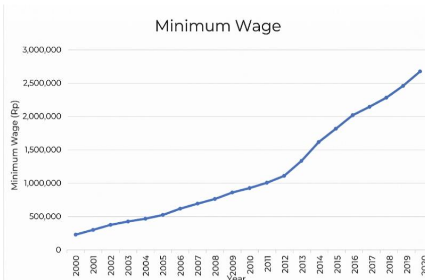
Figure 4. Development of Minimum Wage in Indonesia

The second explanation relates to the magnitude of macroeconomic adjustments after the Asian financial crisis and its impact on sectoral resource allocation. The Asian crisis resulted in Indonesia experiencing both a currency and banking crisis. This was first marked by the depreciation of the rupiah against the US dollar. The rupiah’s exchange rate depreciated by nearly 80% against the US dollar during the period of August 1997, peaking in mid-1998. This significant depreciation hampered imports and stimulated exports. Furthermore, the Asian crisis also led to a banking crisis that impacted the flow of loans to domestic non-financial private companies. Lending to the private sector by domestic banks declined, resulting in an additional liquidity crisis as capital stopped flowing into Indonesia.